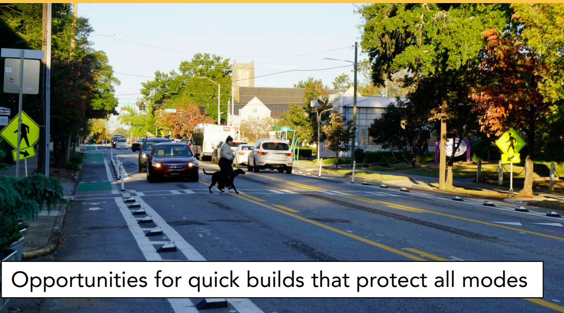
Opportunities for quick builds that protect all modes

prioritizing safety and comfort for peds/bikes vs. prioritizing level of service