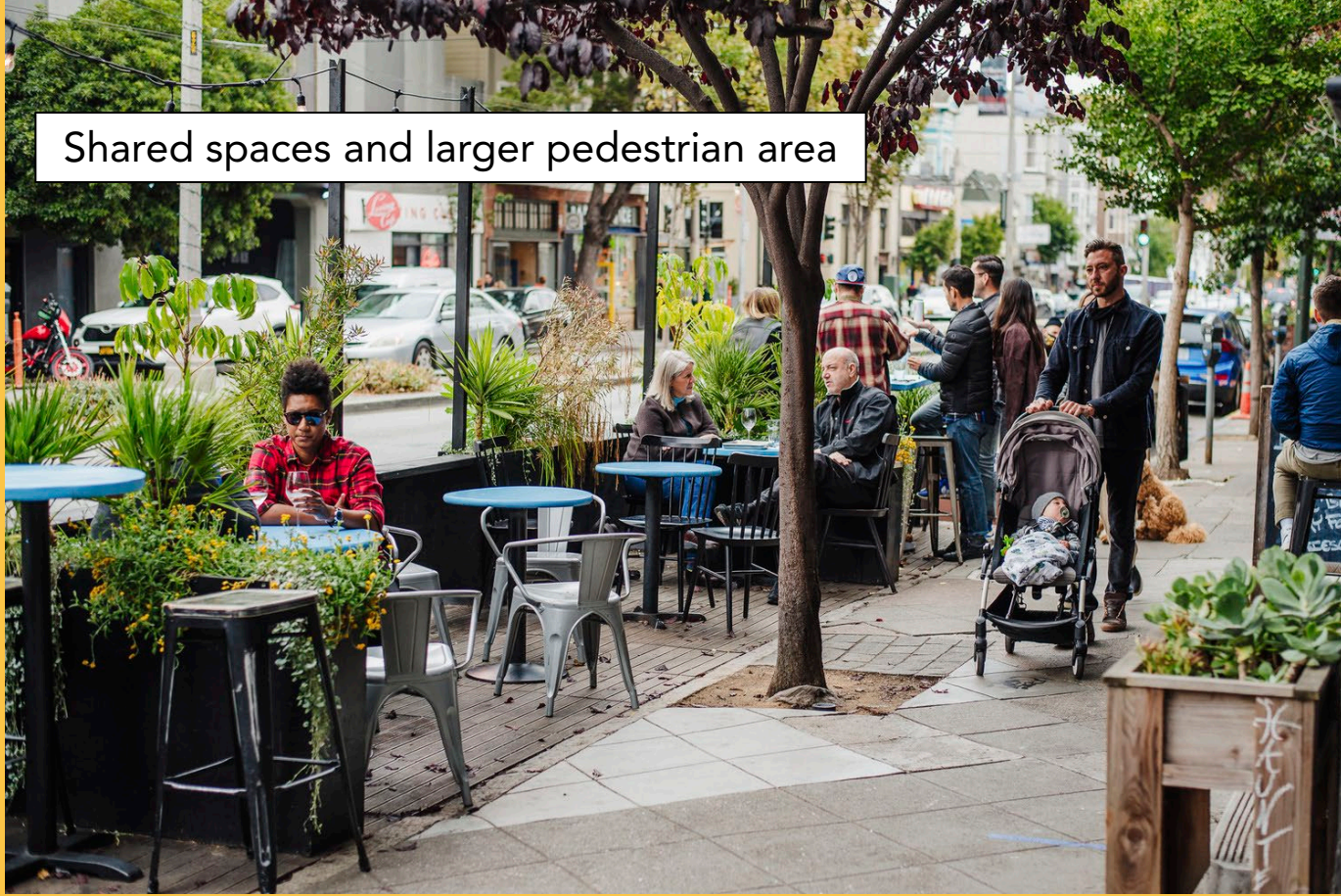
Shared spaces and larger pedestrian area