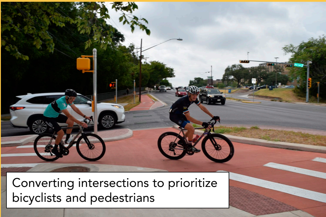
Converting intersections to prioritize bicyclists and pedestrians